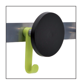
3 rounded pegs for a perfect respect of the clothes + 1 hook for umbrellas and accessories.