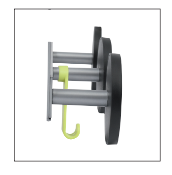
Robust structure and strong pegs (Can support up to 5 kg per peg)